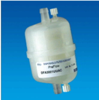
PreFlow™ Capsule Filters